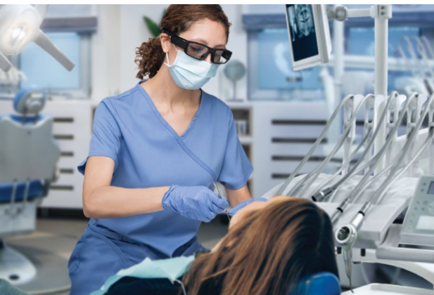
Immediate mobile access to patient data and tests

digital world to the real world, providing unprecedented access to location-aware information, data collection and more. The private, see thru, full color, bright, high resolution screen performs both indoors or in sunlight. The Vuzix Blade is your wearable mobile personal computer for workplace applications.