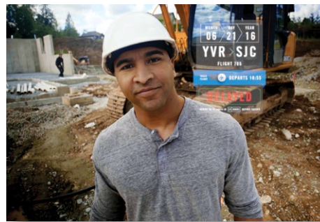
Alerts from the job site