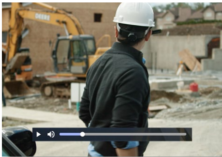
Record videos while on-the-go